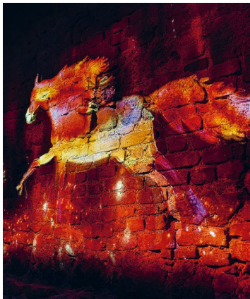
Cellar under the New Town Hall