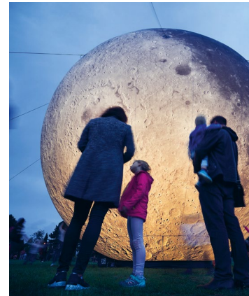
Brno Observatory and Planetarium