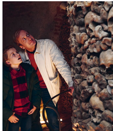
Ossuary of St James