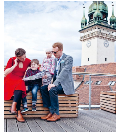
Old Town Hall