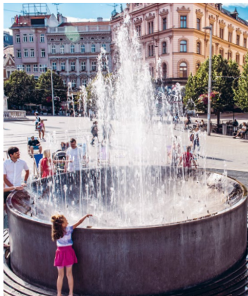
Freedom Square (náměstí Svobody)